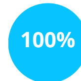
100% Solids Epoxy