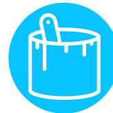
Pour on Application