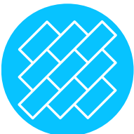
Pavers and Driveways