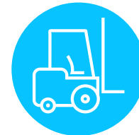
Can withstand Vehicle Traffic