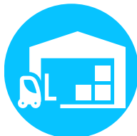
Commercial and Industrial Facilities